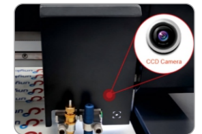
CCD camera and double cutting head